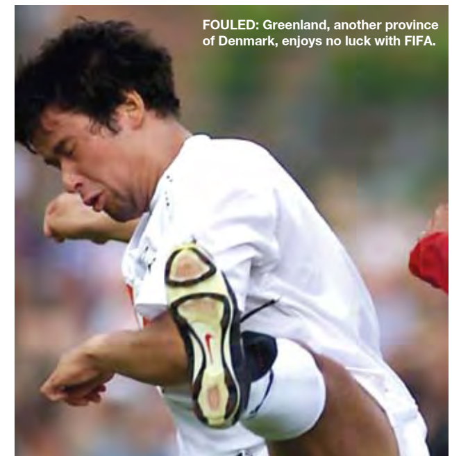
FOULED: Greenland, another province of Denmark, enjoys no luck with FIFA.

Politics might have no part in football but in the lands that FIFA has forgotten, separating the two is virtually impossible.