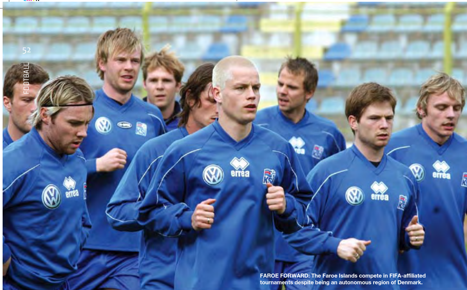
FAROE FORWARD: The Faroe Islands compete in FIFA-affiliated tournaments despite being an autonomous region of Denmark.