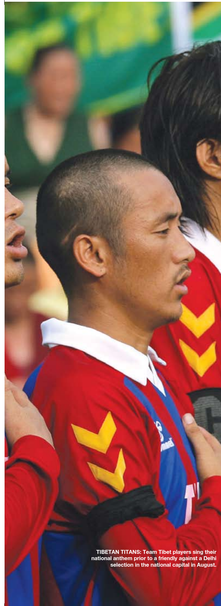
TIBETAN TITANS: Team Tibet players sing their national anthem prior to a friendly against a Delhi selection in the national capital in August.